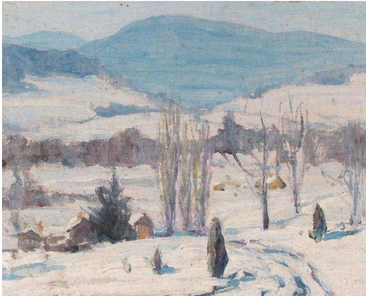
Zulma Steele, Byrdcliffe , c. 1914. Oil on board, 8 1/8 x 10 1/8.

Tickets available on-line at http://www.woodstockguild.org/performance/ or at the door.